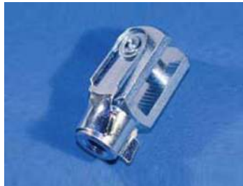
CLEVIS / FORKS