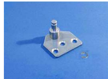
BRACKET BA-SIDE MOUNT